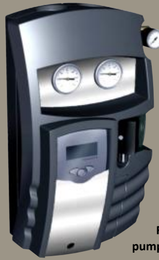
Flo Cal B combined pump station and controller

Button 3 is the SET command, for when you want to make a change to any of the factory-set values.