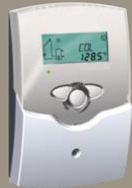
BS3 solar controller